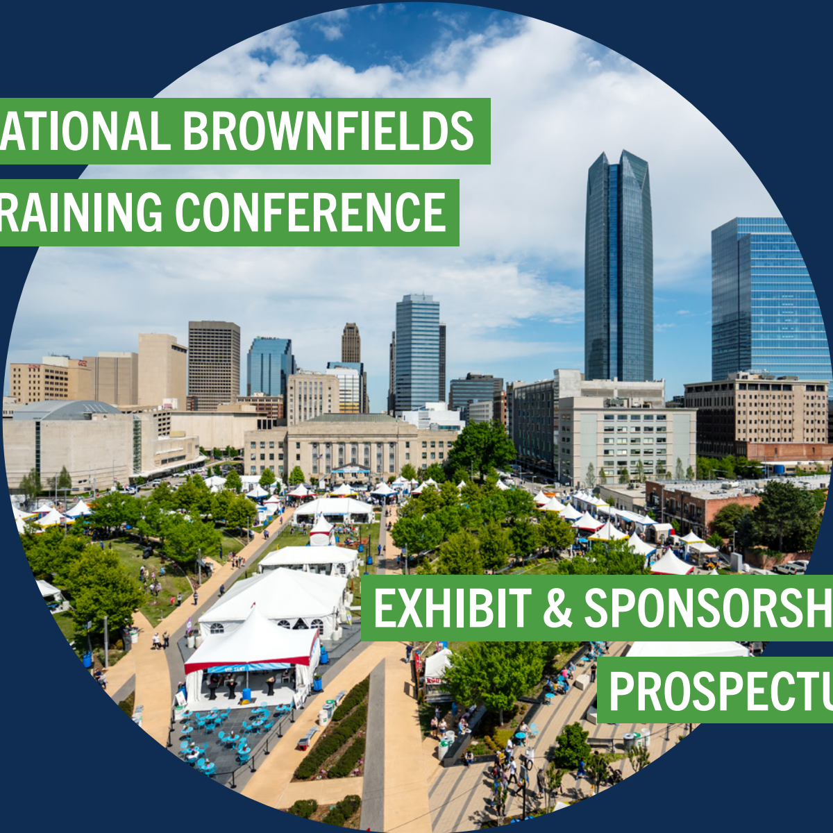
EXHIBIT & SPONSORSHIP